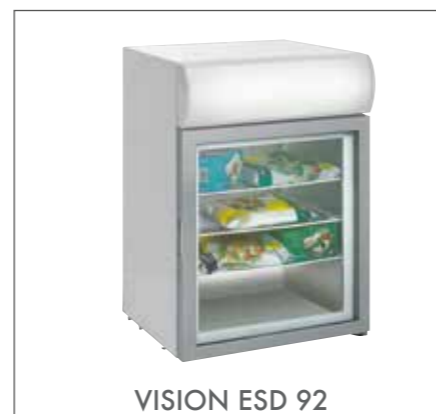
VISION ESD 92