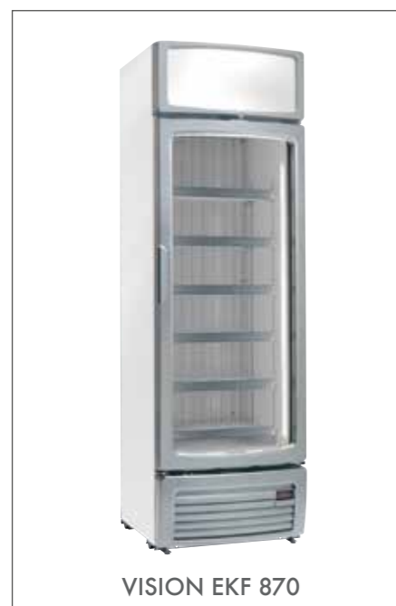
VISION EKF 870