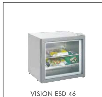
VISION ESD 46