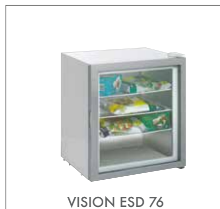
VISION ESD 76