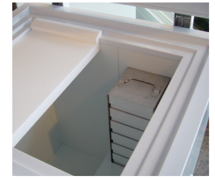
Inner lids (left hand side) which are mandatory for optimized function