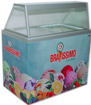
CLASSICAL CLASS CANOPY