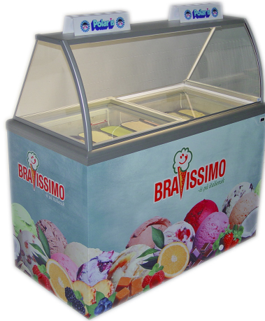
DE LUXE CANOPY