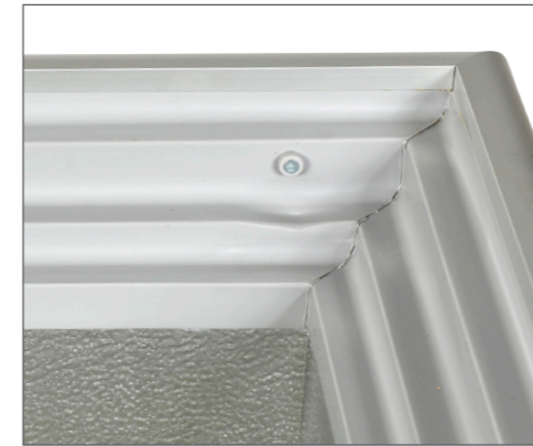
Rail for self closing lid.

At first sight it may look like a traditional freezer for ice cream and frozen food but furthermore we can offer very high quality and reliability. New technologies have allowed us to use compressors with very low energy consumption, which also includes the use of hydro carbons. The lid system is unique. Once you get to the final part of the closing process, the lid is partially self-closing.