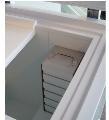
Inner lids (left hand side) which are mandatory for optimized function